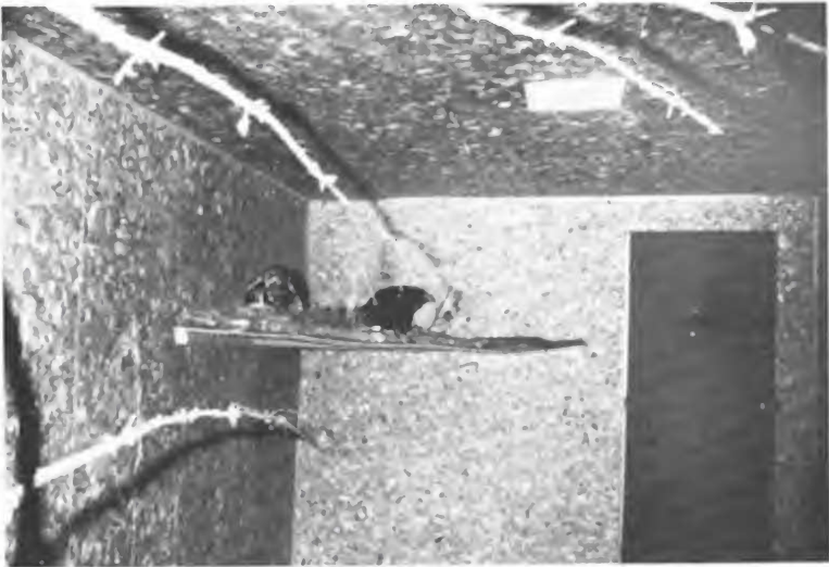
Figure 1. The light-phased female settles upon her eggs as her melanistic mate stands guard in Pen G.